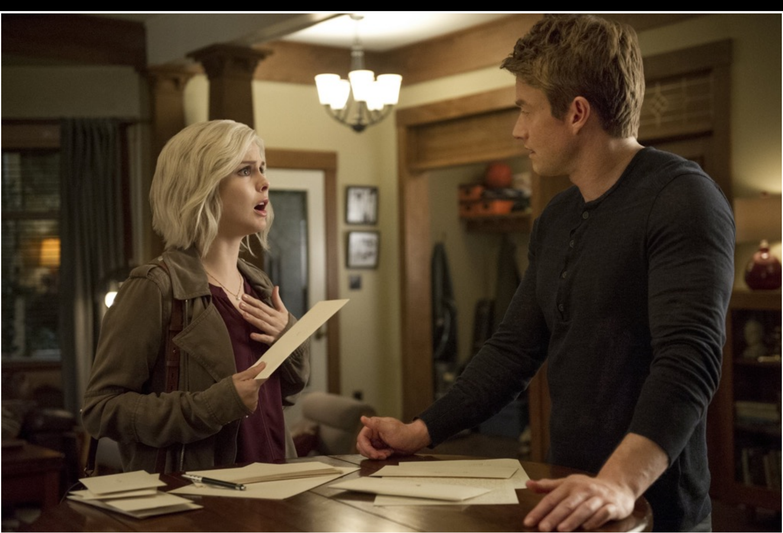
Olivia Moore and Major Lilywhite (Robert Buckley)