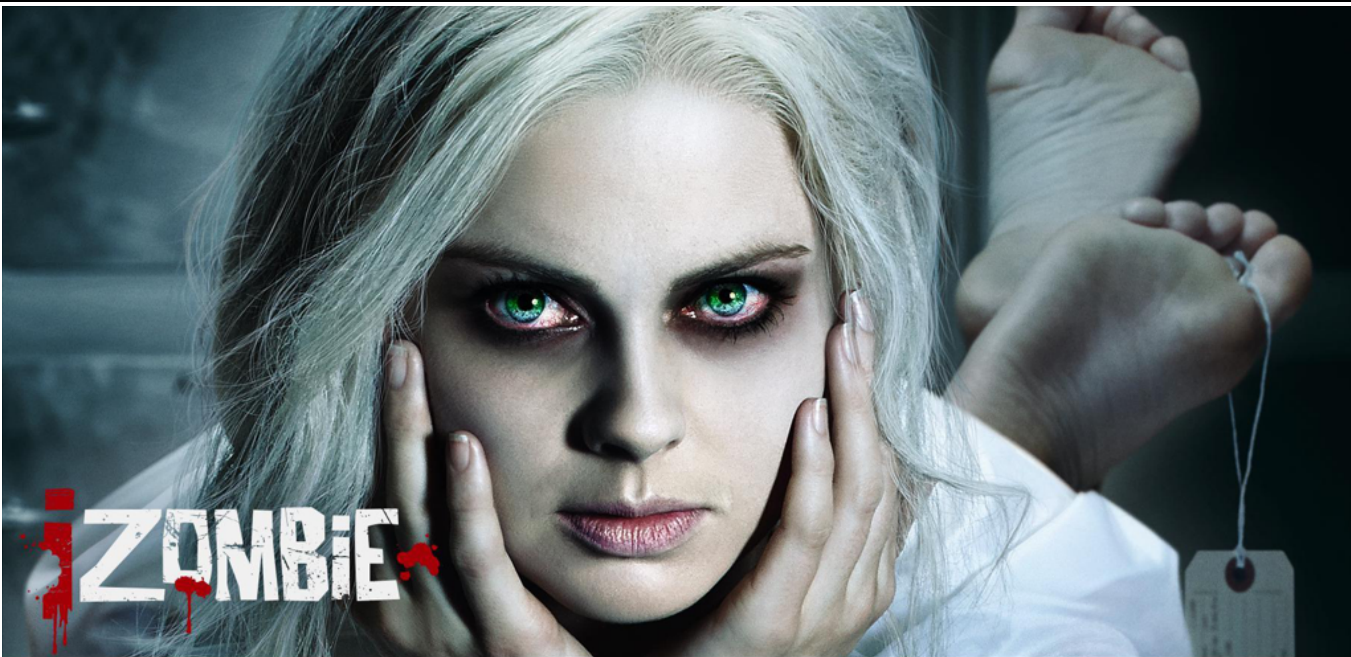
Olivia "Liv" Moore (Rose McIver)