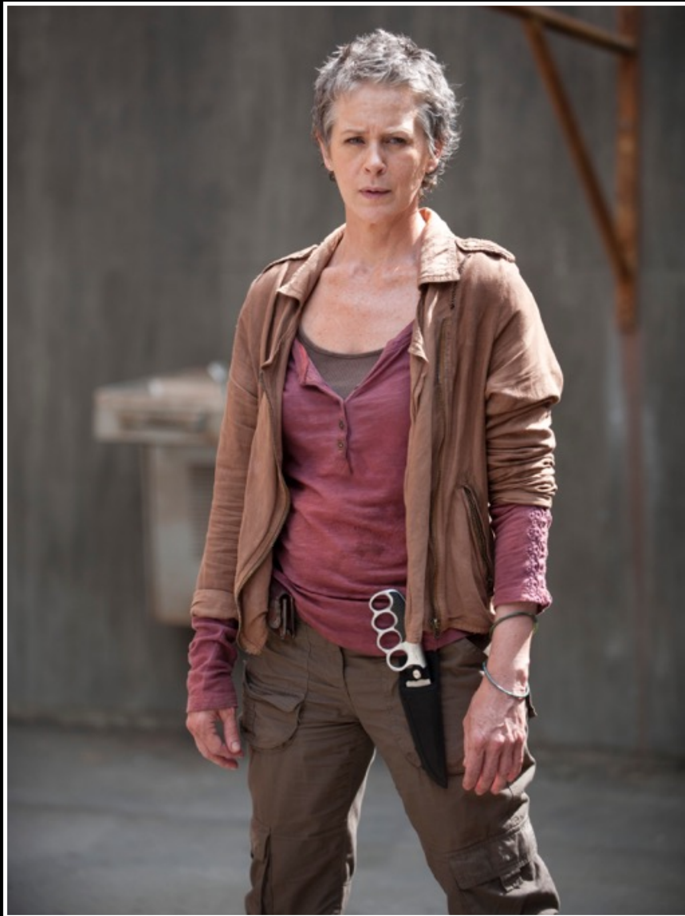
Carol (Melissa McBride)