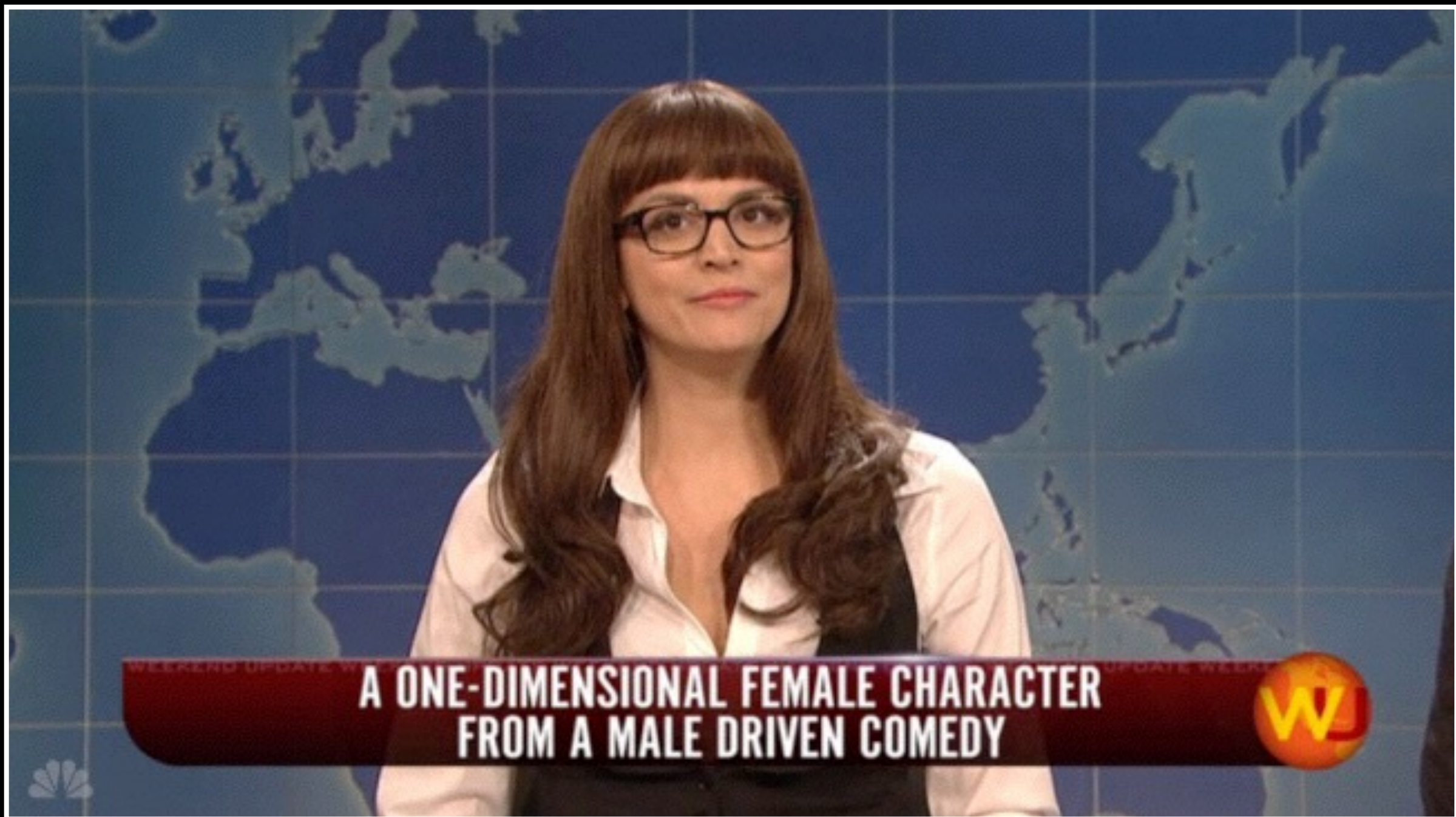
Cecily Strong (SNL)