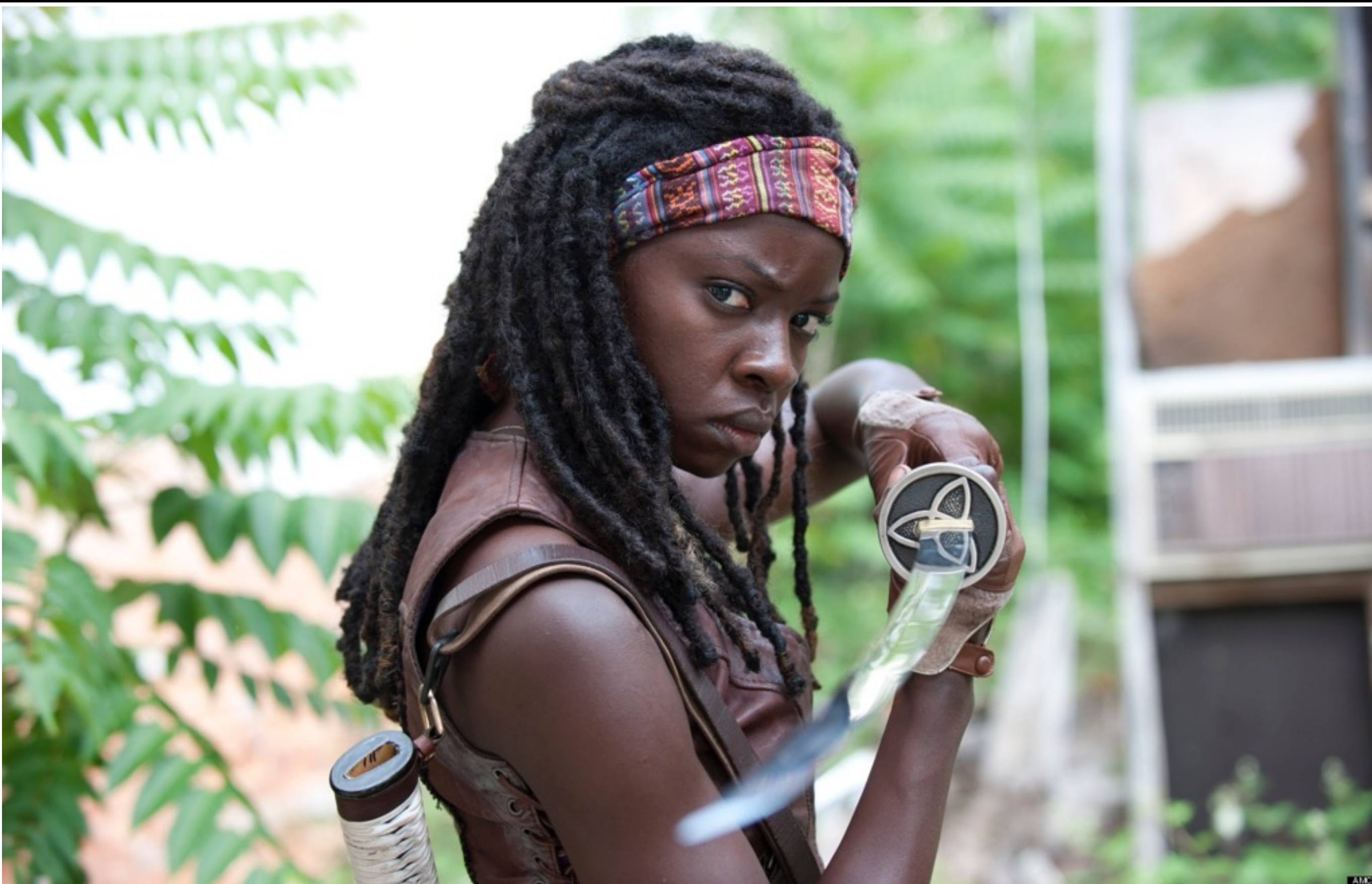
Michonne (Danai Gurira)